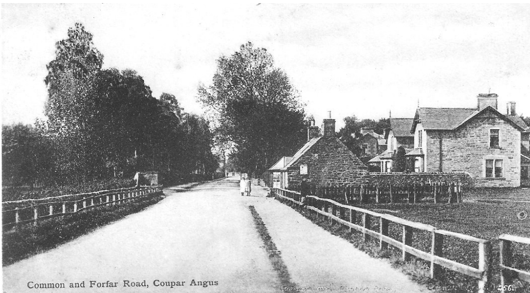
Common and Forfar Road, Coupar Angus

As we start the New Year its nice to look back at the changes of previous years. Take a look at this postcard of the Common and Forfar Road to see how it has changed over the years!